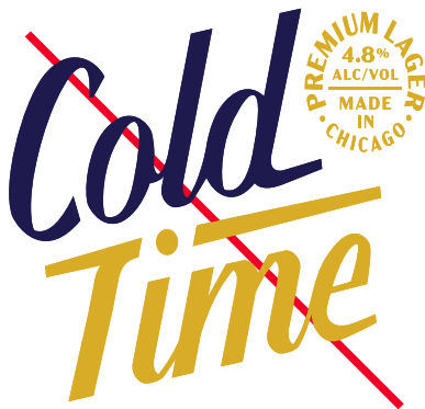
NO logo distortion