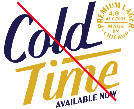
NO additional text locks