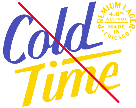
NO alternate colors