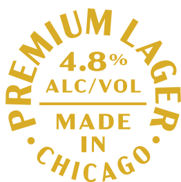
logotype script — customized