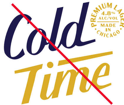
NO alternate spacing