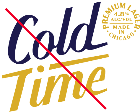
NO unapproved type locks