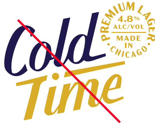
NO altered logo proportions